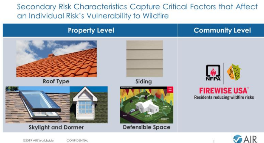
Figure 4 53

Immediate inclusion of mitigation impacts cannot happen in a system relying upon historical loss experience. Rather, an insurer must, under the current