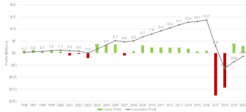
Figure 1 18

An initial observation about the chart is how stable homeowners' insurance profitability was through the 1990's. Insurers viewed wildfire risk as manageable and not a significant driver of long-term profitability. Credit rating agencies did not consider California wildfire risk when rating insurers.