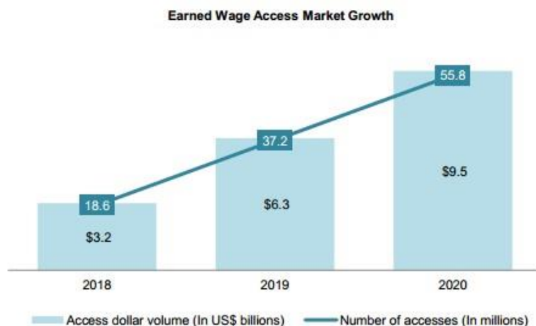
Figure 4: EWA Market Growth

EWA products have soared in use in recent years, with estimated volume nearly tripling from 2018 ($3.2 billion) to 2020 ($9.5 billion). Three of the four largest employers are reported to be offering EWA to their employees. Particularly given this exploding growth, we appreciate the Task Force’s the attention to this market.