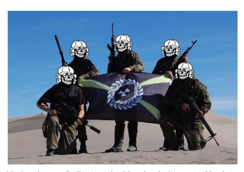
Members of Atomvaffen Division gathered for a three-day hate camp in Nevada in Hate camps represent a critical step for January 2018, dubbed "Death Valley Hate Camp."

Members of WSE groups may also participate in paramilitary training camps or other activities that prepare adherents for violence. The level of preparation can vary, including defensive tactics and the construction of shields, as executed by the Shield Wall Network, to shooting drills.<sup>69</sup> Both AWD and The Base have held training camps for their members referred to by The Base as "hate camps"—throughout the United States, including in Nevada, Georgia, Illinois, and Washington.<sup>70</sup>