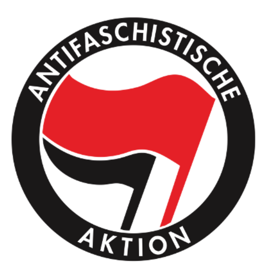
The logo of Anti-Fascist Action, used by many anti-fascist groups. The black flag represents anarchism.

The term anti-fascism has diverse meanings. It can describe a coherent movement, an ideology, an identity, an activity, or a political orientation. 110 Simply defined, anti-fascism is opposition to fascism and its proponents. However, anti-fascists often target a wider array of political opponents than a literal definition of fascism would imply, either because they adopt an overly broad definition of fascism or because they seek to combat a broader array of ideologies that they identify as "farright."111 The single-issue nature of the anti-fascist movement brings together participants who embrace a wide set of political ideologies, typically those considered to be on the left of the political spectrum, including socialism, communism, and anarchism. 112 Organizers often intentionally keep the movement broad, focusing on combating a limited set of beliefs rather than establishing a particular political program. Because the movement's interpretation of fascism tends to be broad,