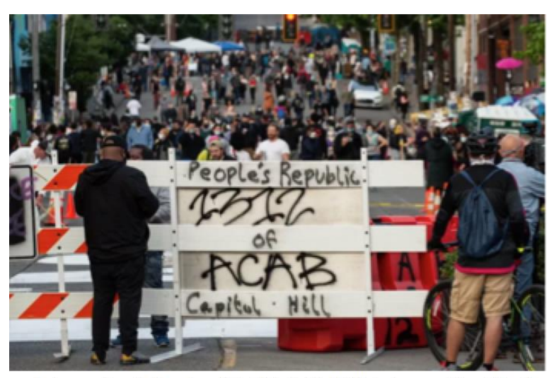
A sign marking the boundary of Seattle's Capitol Hill Autonomous Zone

In rare instances, street violence, or the threat of it, may be employed by militant anarchists and anti-fascists to establish and maintain control of small autonomous spaces. These spaces may then be used by activists for protest activities, community organizing, or as a refuge for populations they believe to be victimized (for example, undocumented migrants). Autonomous spaces have been formed in both the United States and Europe. The most prominent in Europe – and the one most closely associated with anarchists and antiis fascists the Exarcheia