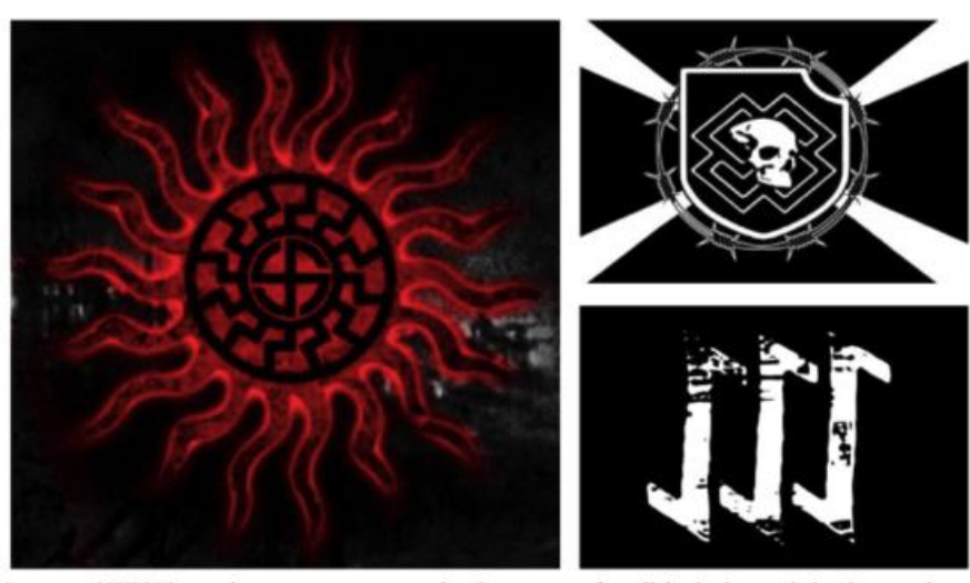
Logos of WSE accelerationist groups: the Sonnenrand or Black Sun of the Sonnenkrieg Division (left); the logo of the Feuerkrieg Division (top right); and the logo of The Base (bottom right).

Atomwaffen (AWD).35 AWD is a WSE group with an international membership that seems to have emerged in 2015 from the now-defunct internet forum Iron March, though AWD's founder claims the group was organized several prior. AWD vears organized into cells that appear to operate with a high degree of independence.<sup>36</sup> The organization has explicitly violent aims and seeks to