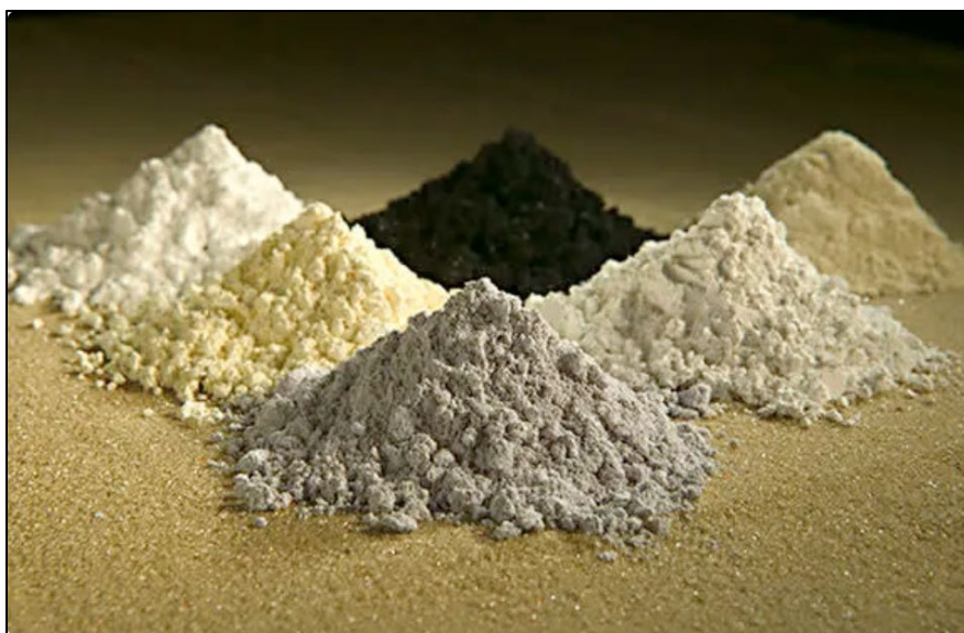
Rare Earths, clockwise from top center: praseodymium, cerium, lanthanum, neodymium, samarium and gadolinium. xxii

This comes at a time when our domestic deposits of these minerals can't keep up with our demands. We have historically imported about 80 percent of our rare earths from China, compared to about 23 percent of our oil imported from the Middle East. As a frame of reference, OPEC only accounts for 40 percent of the world's oil, but China currently accounts for about 75 percent of global lithium-ion battery cell capacity, compared to just 7 percent for the United States. xxi For us to achieve our green-energy ambitions in the automotive industry, we face significant upward hurdles if China remains unopposed in a post-U.S. drawdown Afghanistan. The electric vehicle battery industry is just one example of many of the supply chain challenges that will become significantly more complicated if and when Beijing seizes and mines Afghanistan's rare earth minerals.