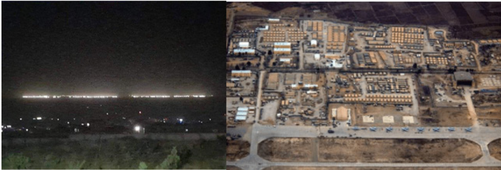
Figure 1. Left: Open-source available images taken 2 October 2021, of Bagram Airfield, Parwan. Right: Aerial photographs taken shortly thereafter, proclaiming to indicate the presence of Chinese aircraft.

to embarrass and undermine the United States in the information environment.