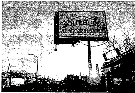
A green strobe flashes on top of a sign as the sun starts to set behind Southern Smokehouse on West McNichols Road in Detroit, Michigan on Thursday, April 19, 2018. This carry out BBQ restaurant participates in the Detroit Police Green Light program.