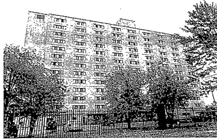
Project Green Light is coming soon to the Sheridan Place apartments in Detroit seen here on Thursday, November 1, 2016.